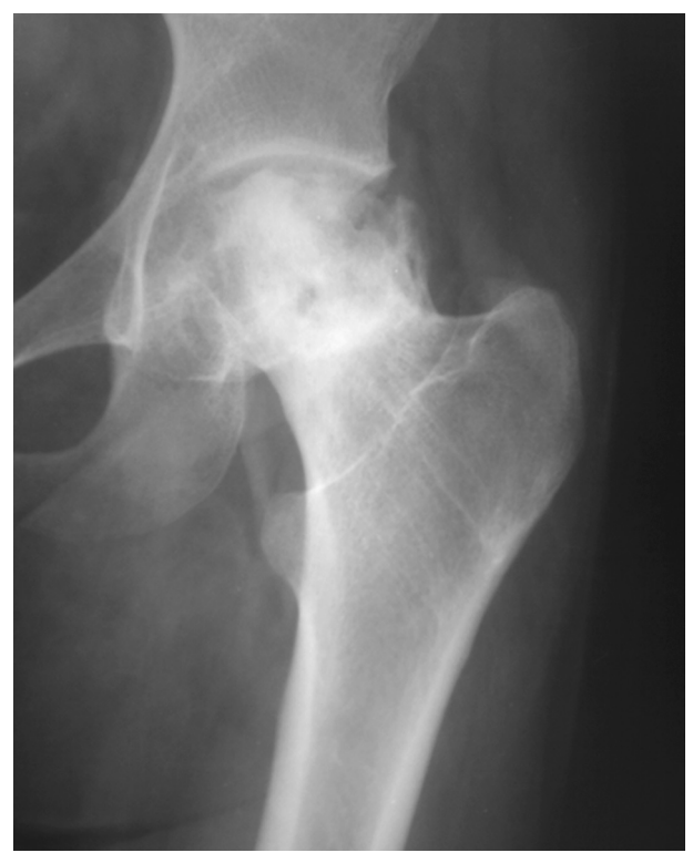
Figure 2-D. Complete aseptic necrosis of the femoral head and osteoarthritis of the hip are seen three years postoperative. Sclerotic changes are evident in the walls of the cancellous screws channels

Figure 2-B and 2-C. Antero-posterior and lateral views radiograph was made four months postoperative. The screws placement is deemed improper. However, The fracture healed in an anatomic position