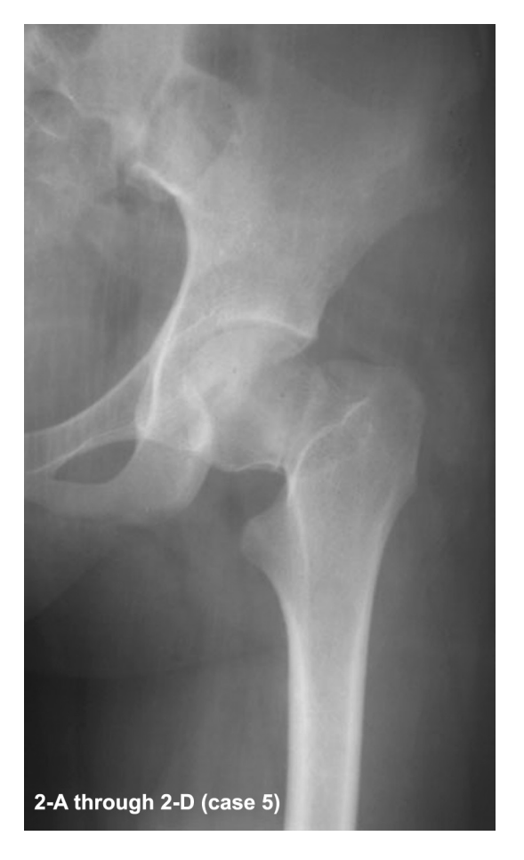
Table 2. Clinical outcome for 27 patients were managed for intracapsular fracture of the femoral neck

Figure 2-A. Preoperative A-P radiograph for hip joint of seventeen-years-old girl with a Garden grade III fracture of the left femur