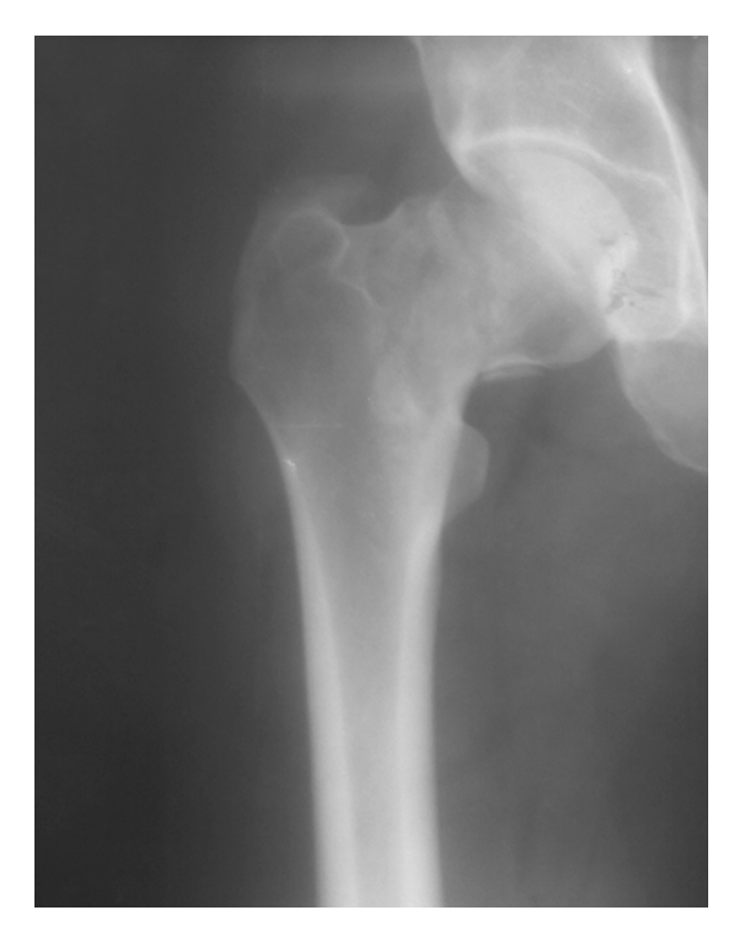
Figure 1-A. Preoperative A-P radiograph of hip joint of 33-years-old man with a Garden grade II fracture of the right femur

tern of screw placement was proper in 22 patients (81.50%) and in 5 patients (18.50%) was improper (Table 1). The placement has been considered improper because the distance between the screws of the DHS/DRS composite is les than 0.5 cm in two patients and the cancellous screws crossed each other at an angle of more than 10° in two patients. In the fifth patient, the cancellous screws crossed each other and penetrated the femoral head (Figure 2-B and 2-C). Of the 5 patients with improper placement of the screws, one had loss of reduction at two months (Figure 1-C through 1-E) and one has exposed to second operation for removal of the screws (Figure 2-B through 2-D), however no complications have been reported in the rest of the 5 patients.