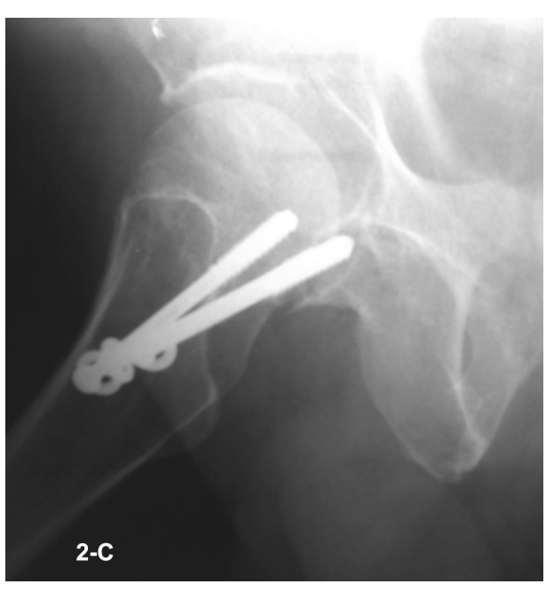
Figure 2 C

Figure 2-B and 2-C. Antero-posterior and lateral views radiograph was made four months postoperative. The screws placement is deemed improper. However, The fracture healed in an anatomic position