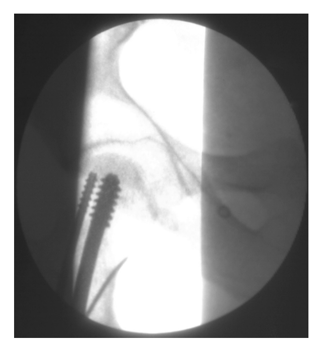
Figure 1-B. A photo was taken intraoperatively from the screen of the image intensifier shows the K-wire peeping from the cortex of the femoral neck anteroinferior to the screws of the DHS/DRS composite

At the most recent examination the femoral neck-shaft angle was >130^{\circ} in 26 patients (96.30 %) and one patient (3.70%) reported varus angle (Figure 1-F).