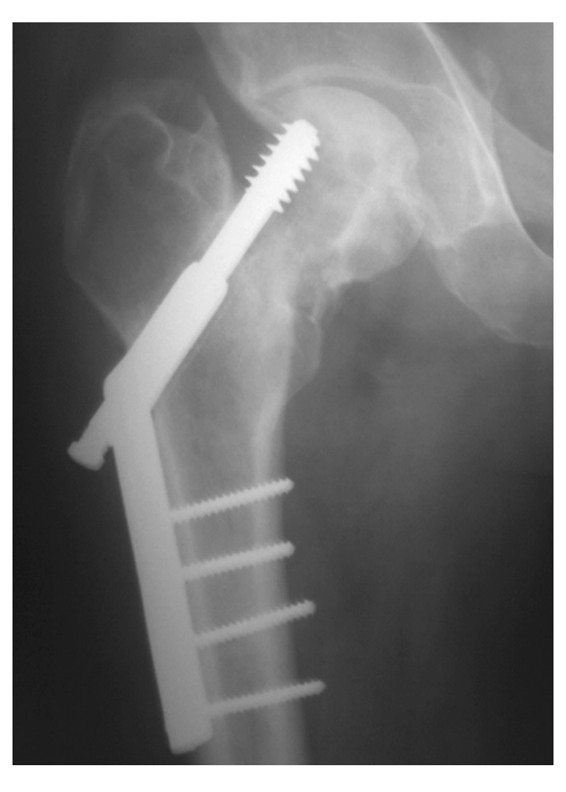
Figure 1-F. The fracture healed in varus neck-shaft angle and the DRS was removed. No evidence of osteonecrosis can be seen

Figure 1-D and Figure 1-E. Antero-Posterior and lateral radiographs were made two months postoperative show the fracture has lost reduction and the screws migrated superiorly within the head. In the lateral view Figure 1-E the screws of the DHS/DRS composite lost its parallelism